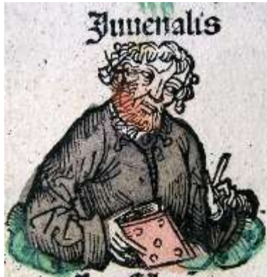
Woodcut of Juvenal from the Nuremberg Chronicle, late 1400s